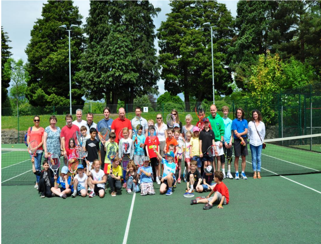
Group Photo of STC juniors, parents & helpers at the Rally for Bally event June 2014